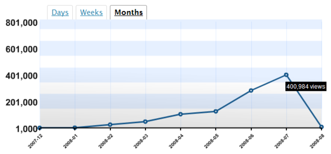
Page views from January 2008 – July 2008

Wordpress stats is my built in stats tracking program that I use daily to measure my page views and other website statistics. Unlike programs like <u>Google Analytics</u> and other ranking services that rely on Javascript to measure page views, Wordpress stats measures direct page access. If a user has Javascript disabled for security reasons, they will appear invisible to many tracking services. I prefer to use Google Analytics to track user trends however I rely on Wordpress stats to measure the true monthly page views for xorsyst.com.